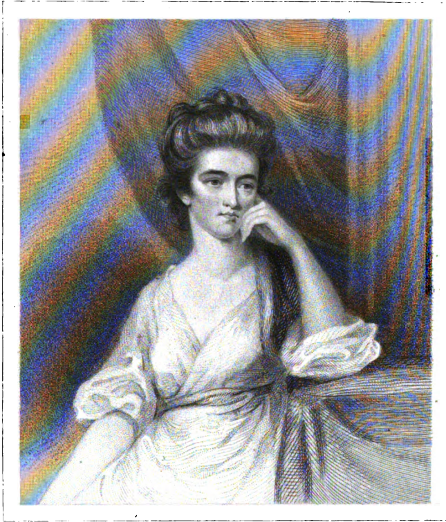
THE DUCHESS OF ALBANY.